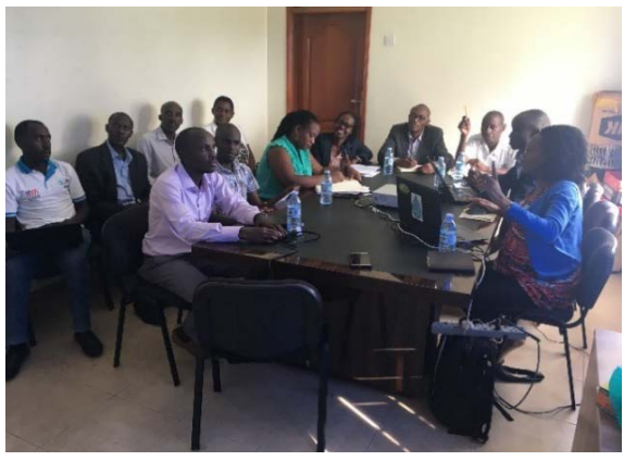
Kamwenge DIP Committee in Session (May 2018)